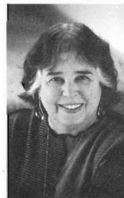
Jane Yolen