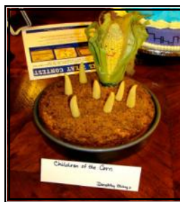
Children of the Corn