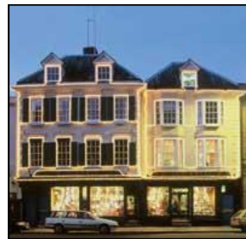
Blackwell's famous bookshop in Oxford, founded in 1879

In Spring of 2008, the Olin Library worked with a consulting company to help us streamline, automate, and expedite the manner in which we acquire our books. The goal was to align our library operations with the rapidly evolving nature of patron expectations. Libraries of the 21 st century have increasing demands for electronic resources, remote access, and a rapidly expanding array of resources beyond the book. This means that staff positions, budget lines, and collection development efforts must be revamped in order to support the needs of a modern college library.