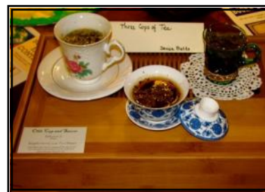
Three Cups of Tea