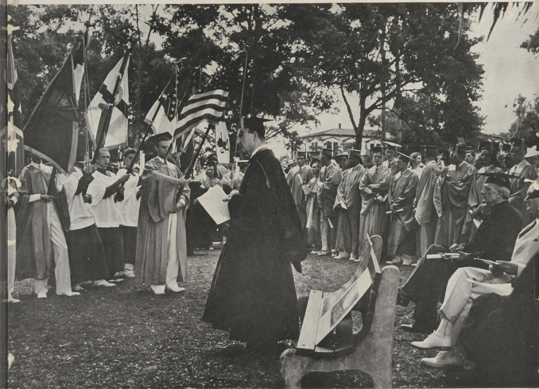
The ceremony of breaking ground for the Student Union and Alumni Building.