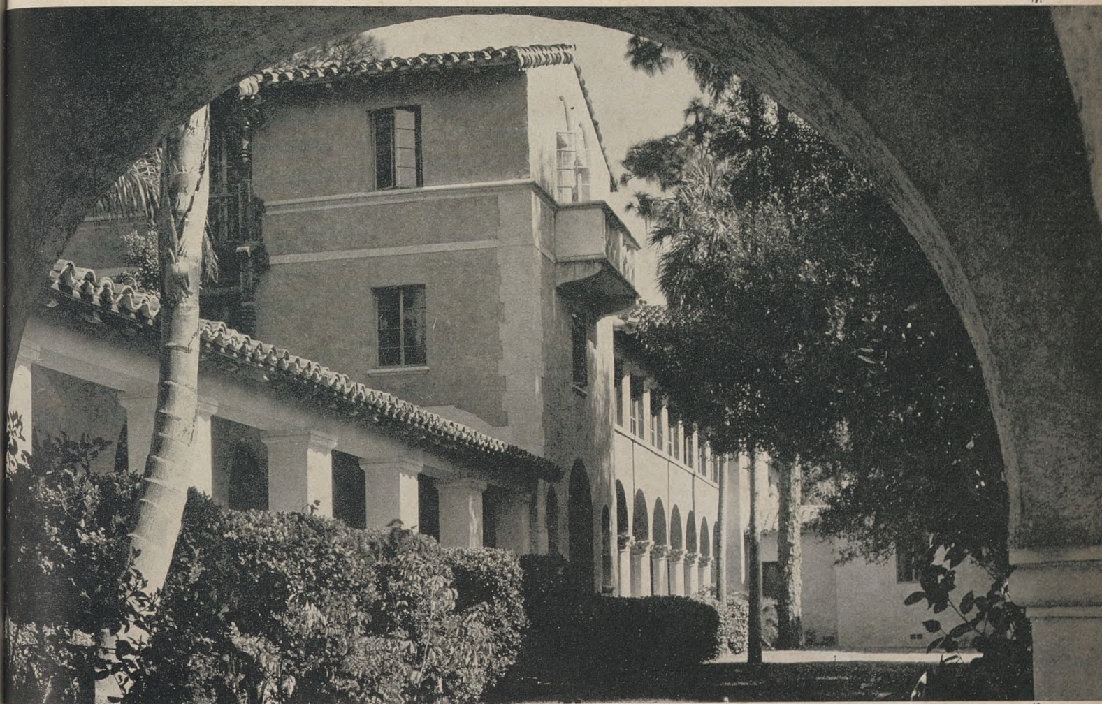
Through the Arch