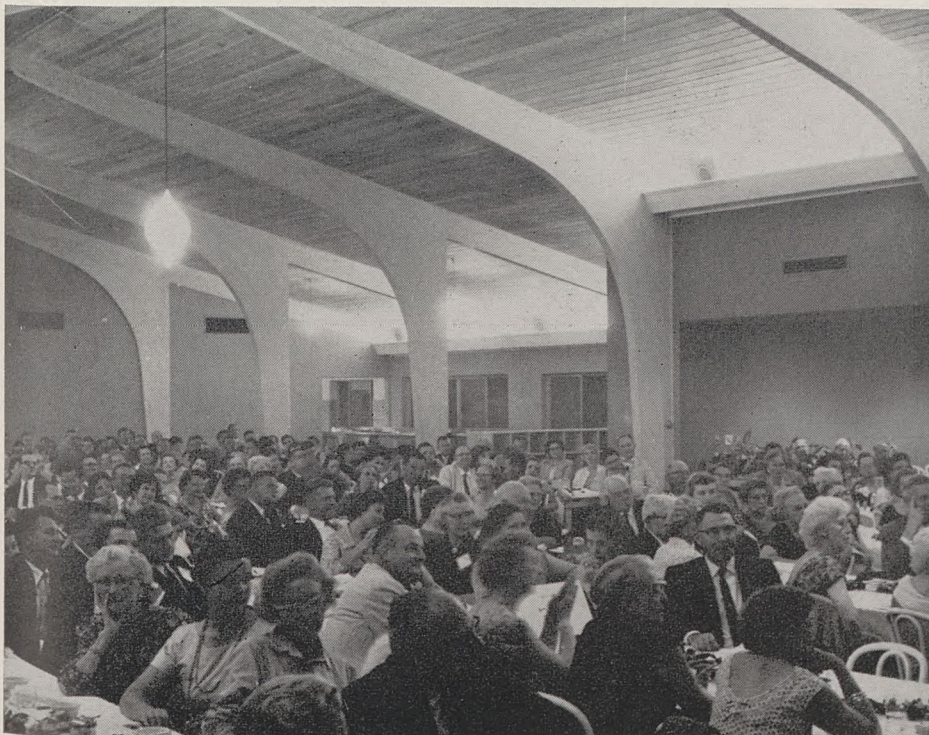
The Rollins "300" at Rose Skillman Hall.