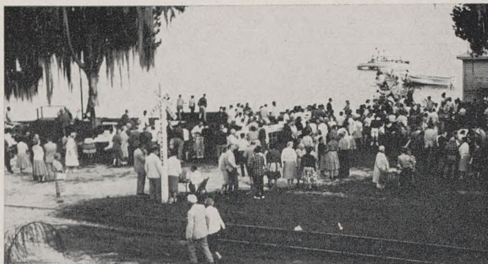
PICNICKERS ASSEMBLE — The crowds at Lake Virginia assembled early for an evening of chicken-in-the-rough, water games and renewal of old acquaintances. In comparison to past years the picnic was one of the most successful ones the alumni can remember.