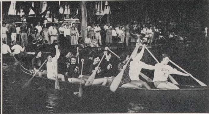
CHI O's GET SET — A canoe full of Chi Omega women is getting set for the "rugged" Lake Virginia course as alumni assemble on the shore to witness the forthcoming battle. There was a lot of splashing, dunking and shouting — all summarized in one word "fun."