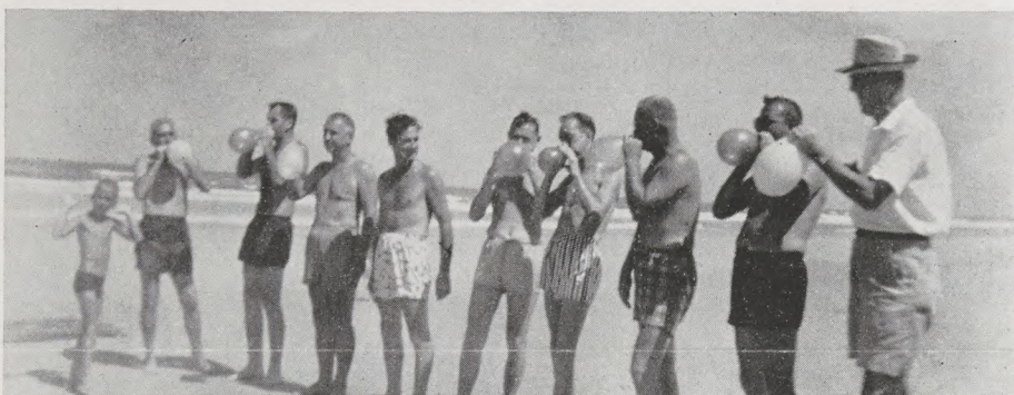
of the highlights of the Central Florida Club program. The fact that most of the Alums present had from one to four children with them added to the merriment. The babies crawling race with about ten entries was one of the highlights of the special events. The picnic was under the chairmanship