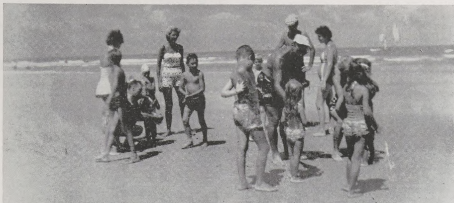
Members of the Central Florida Alumni Club, their wives, husbands and children, about 130 in all enjoyed their annual picnic at the Pelican, the College's beach house at New Smyrna Beach, Sunday August 23. The annual affair for Alumni and their families living in Central Florida is one