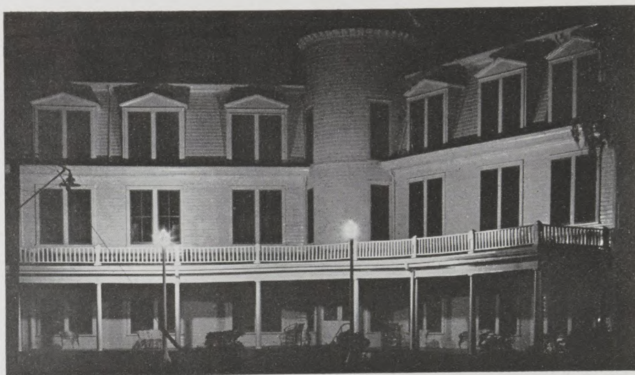
Cloverleaf by lamp light presents an interesting study. The picture was taken by Lyman Huntington, College Photography Department, just before the more than 700 Alumni and friends of Rollins began to arrive for the formal reopening September 27.