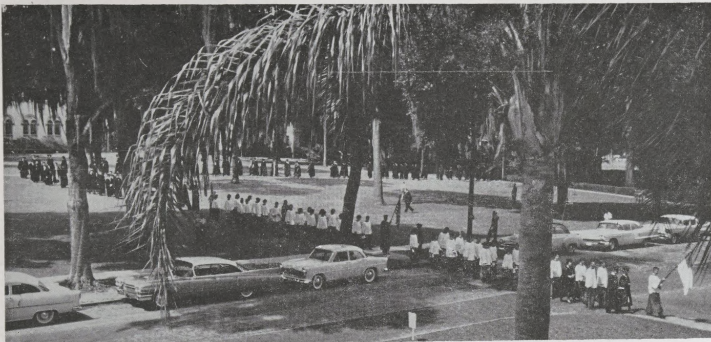
Led by the Chapel Choir the colorful academic procession files down the center of the Horseshoe and crosses Holt Avenue to Knowles Memorial Chapel for the 1960 Commencement Exercises.