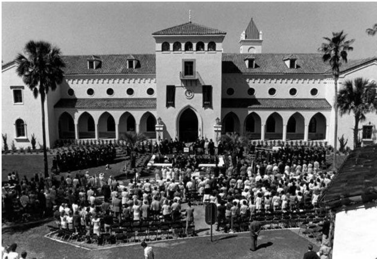
Olin Library dedication ceremony, 1985

On April 17, we celebrated Olin Library's 30th birthday! Happy Birthday Olin!