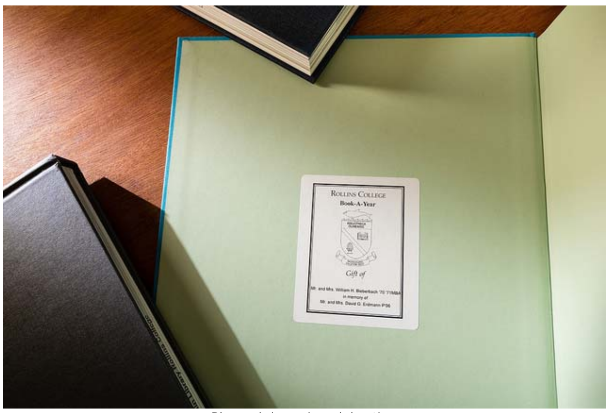
Please join us in celebrating <u>Winter With the Writers</u> and the <u>Olin Library Book a Year Program</u> on Wednesday February 11th, from 5-7 p.m. in the Galloway Room