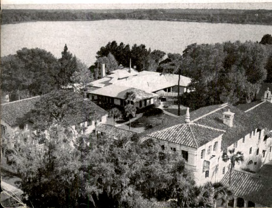
THE COLLEGE COMMONS LIES BEYOND THE MEN'S DORMITORIES