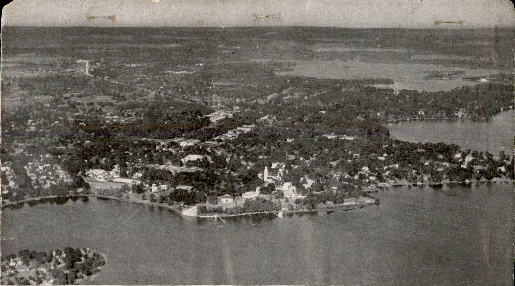
AIRPLANE VIEW OF THE CAMPUS AND CITY OF WINTER PARK SHOWING THEIR BEAUTIFUL LOCATION AMONG THE LAKES