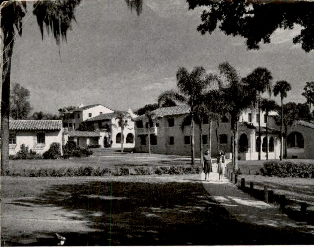
THESE DORMITORIES HOUSE UPPER CLASS WOMEN