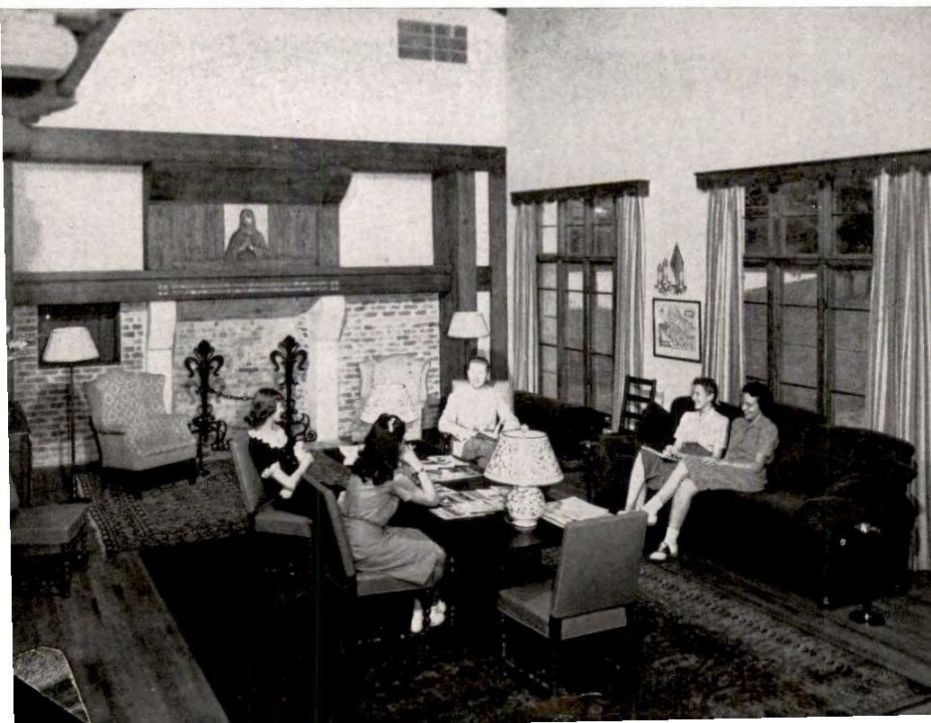
LANGUAGE MAJORS MEET IN SMALL CLASSES