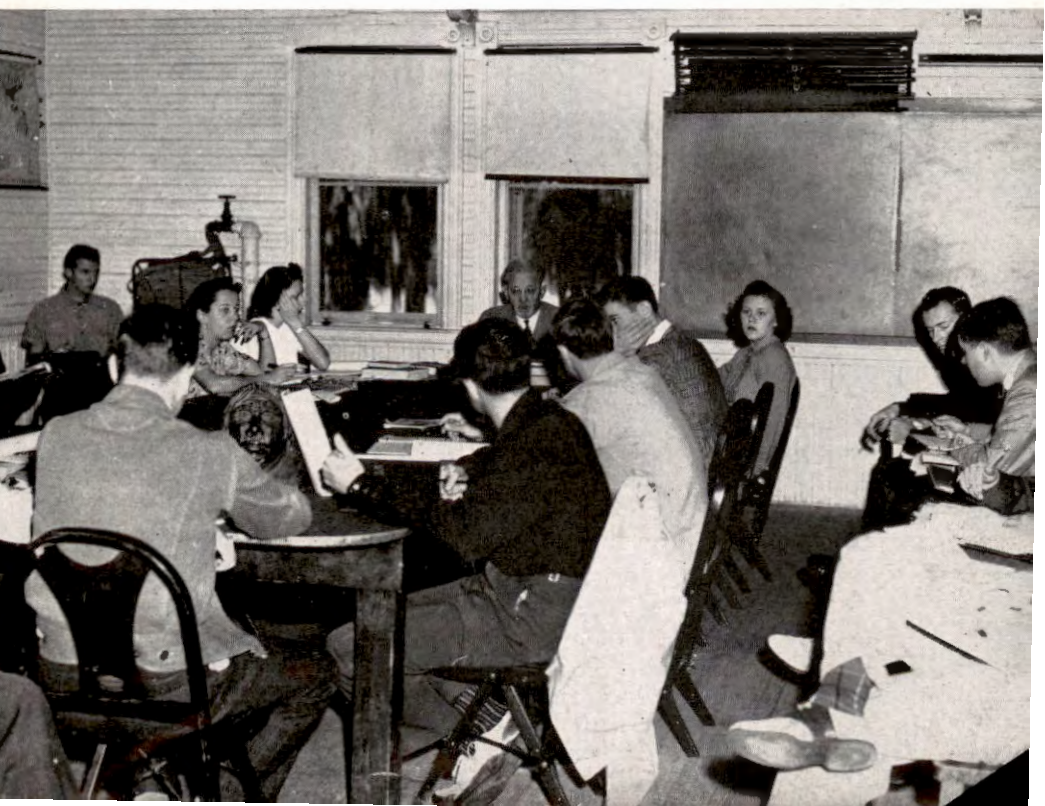
A CLASS CONSIDERS A PROBLEM IN ECONOMICS