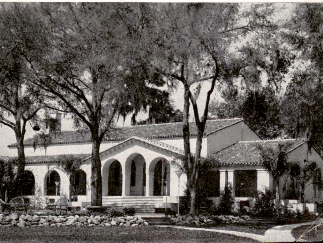
THE ROLLINS CENTER IS THE HUB OF STUDENT ACTIVITIES