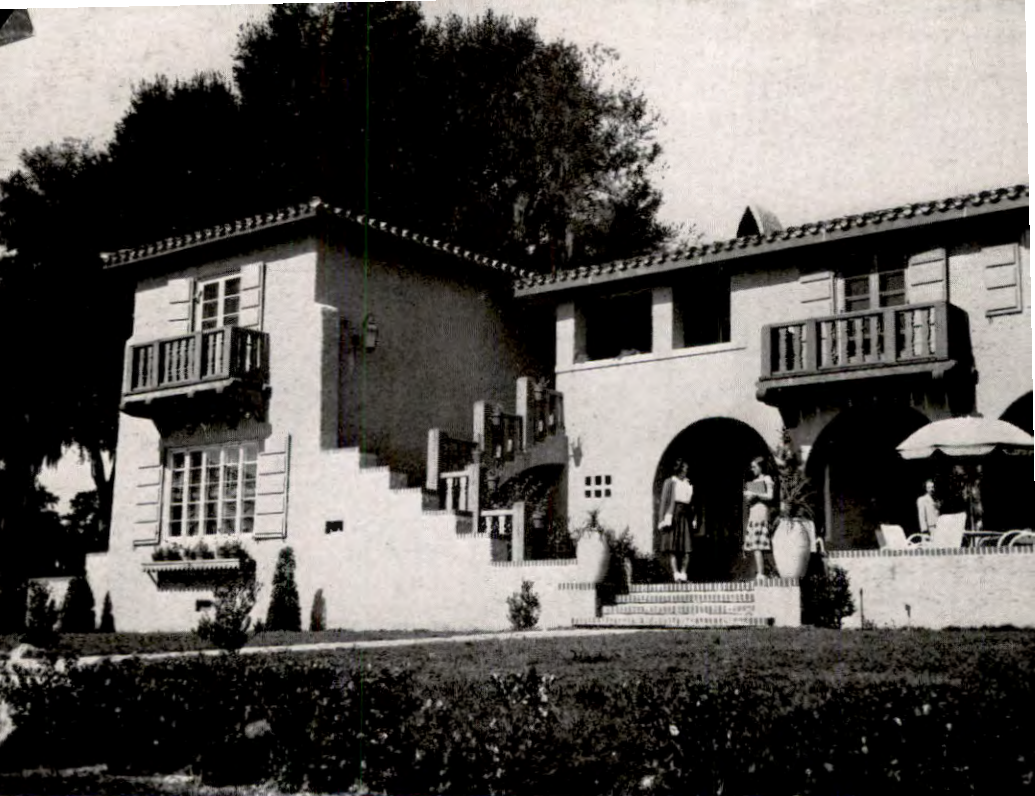
LA MAISON PROVENCALE IS USED FOR LANGUAGE CLASSES