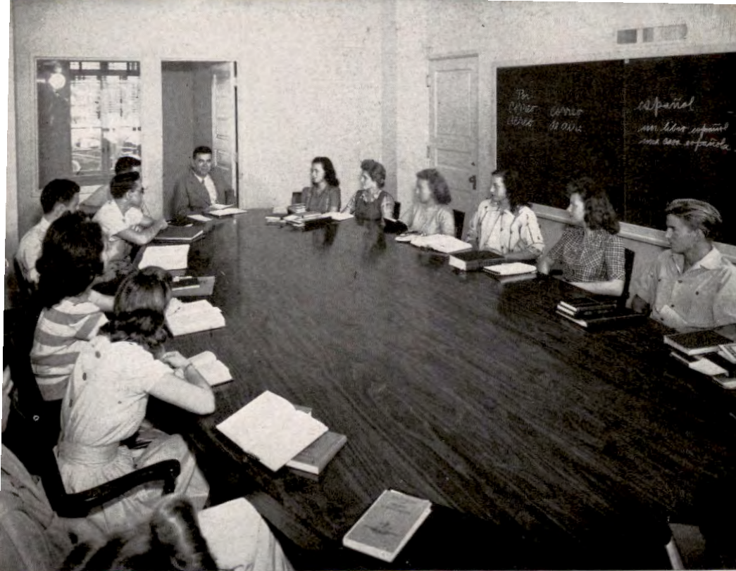
THE ROUND TABLE METHOD OF DISCUSSION EXEMPLIFIES THE CONFERENCE PLAN