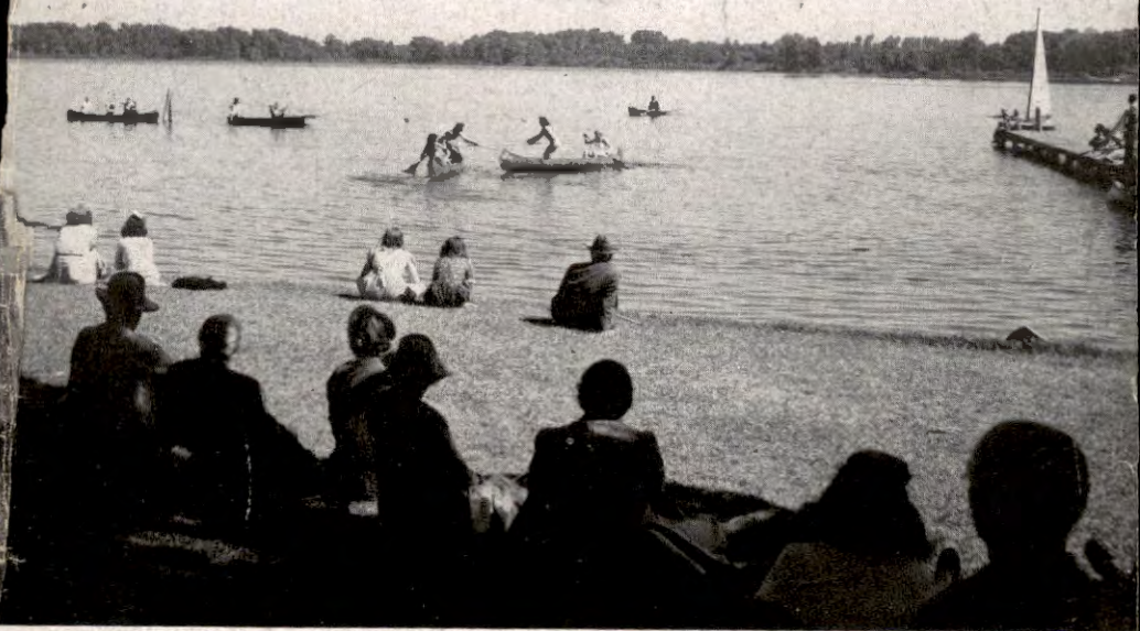
THE CAMPUS BORDERS ON LAKE VIRGINIA