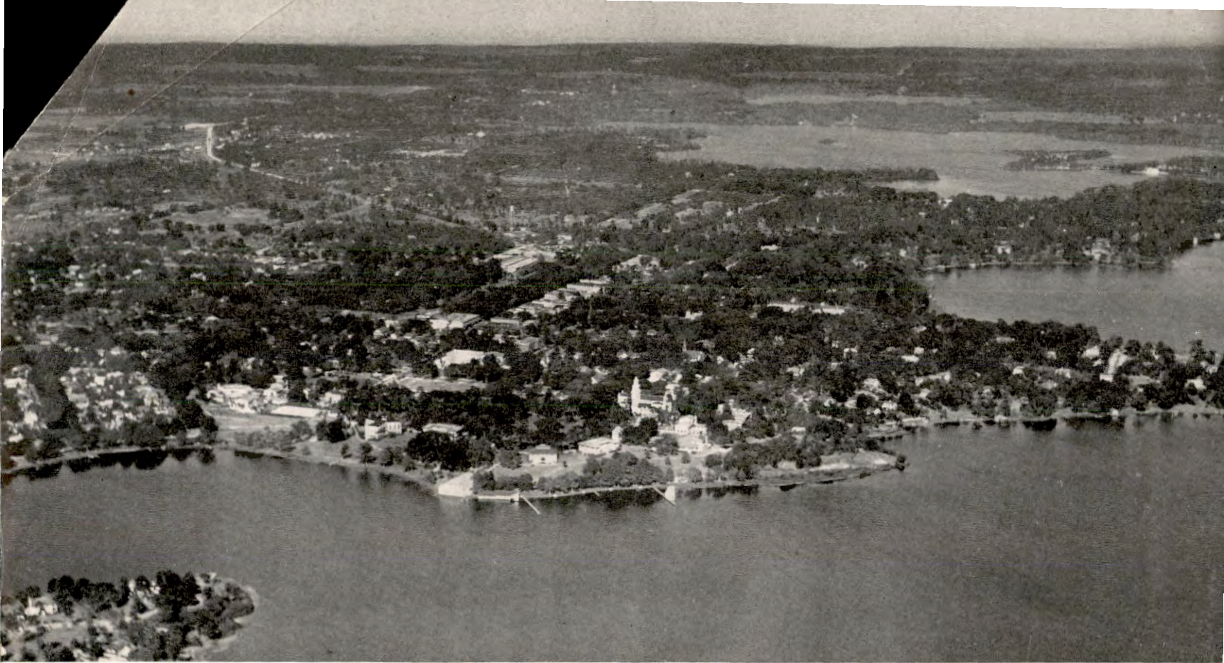
AIRPLANE VIEW OF THE CAMPUS AND CITY OF WINTER PARK SHOWING THEIR BEAUTIFUL LOCATION AMONG THE LAKES