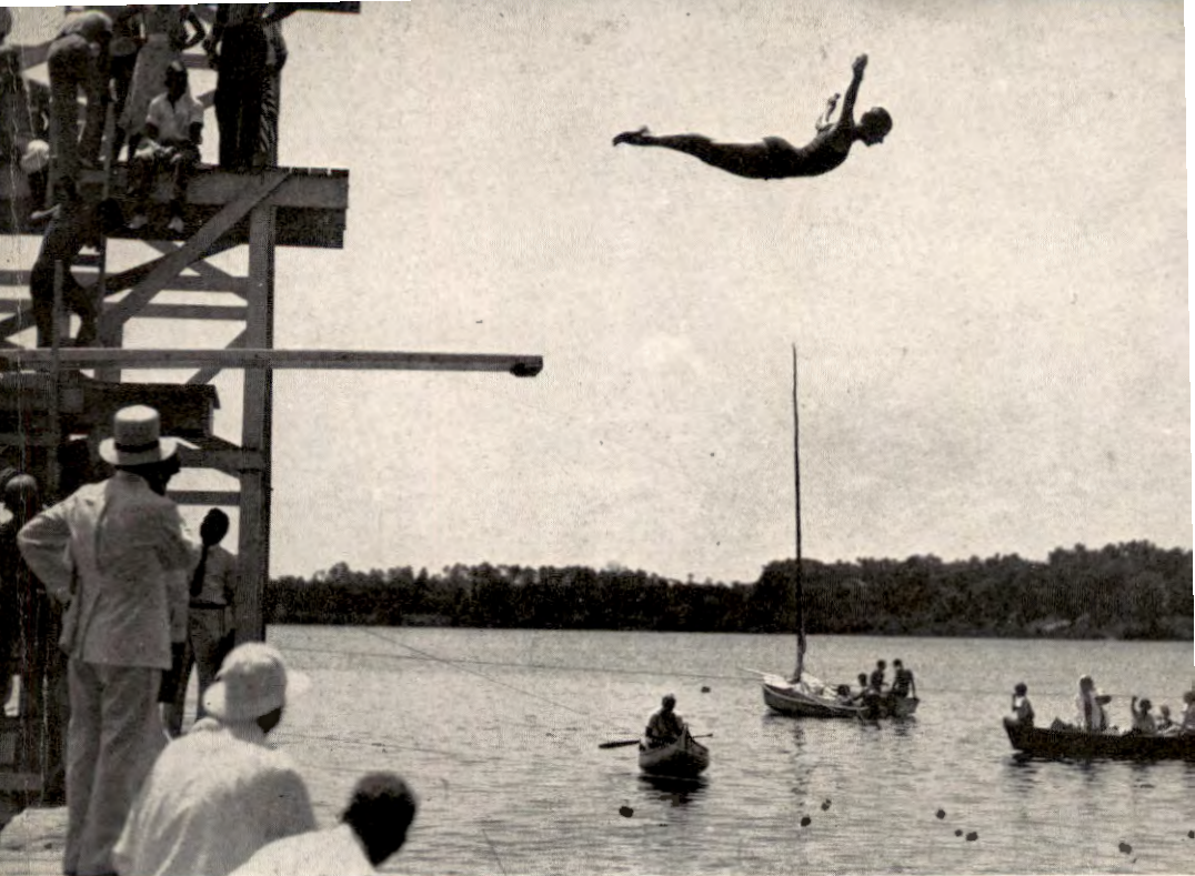
THE CAMPUS BORDERS ON LAKE VIRGINIA