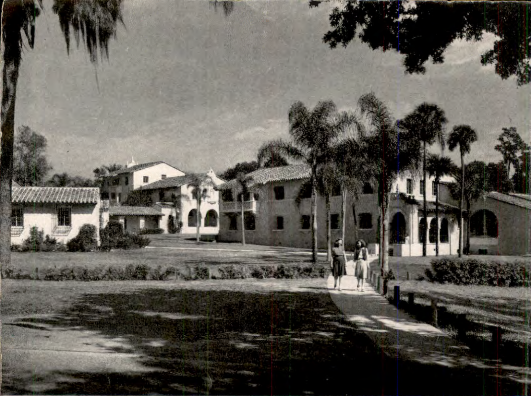
THESE DORMITORIES HOUSE UPPER CLASS WOMEN