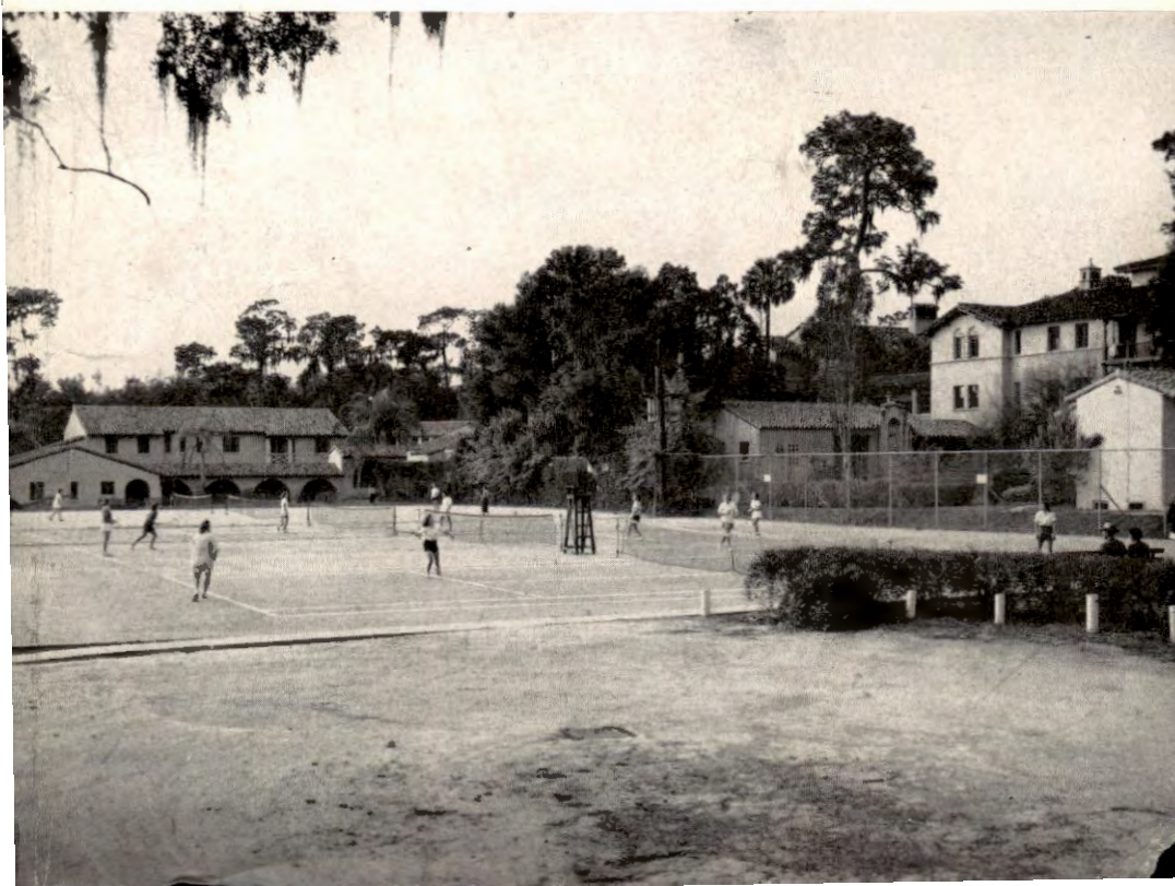
TENNIS IS A YEAR-ROUND SPORT