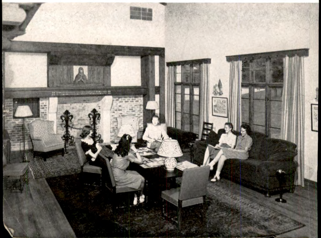
LANGUAGE MAJORS MEET IN SMALL CLASSES