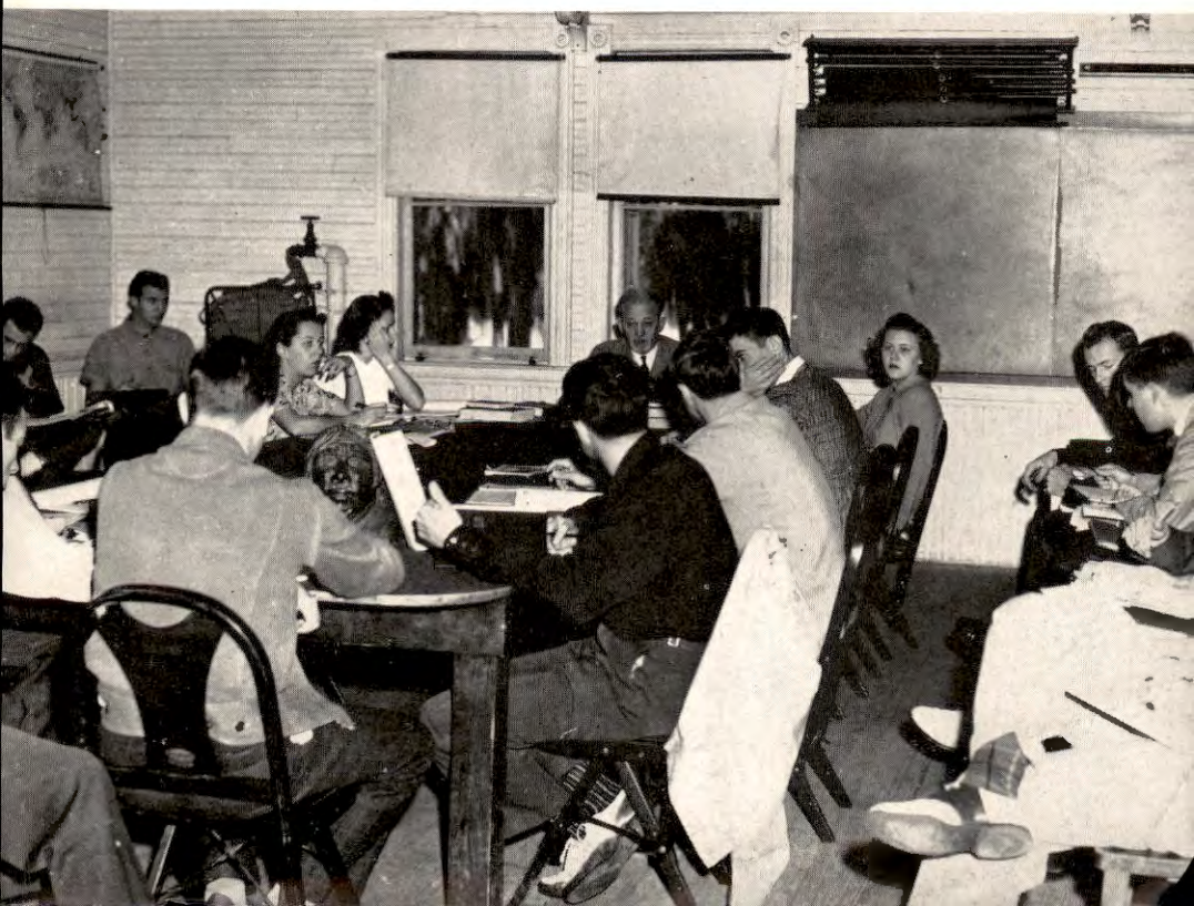
A CLASS CONSIDERS A PROBLEM IN ECONOMICS