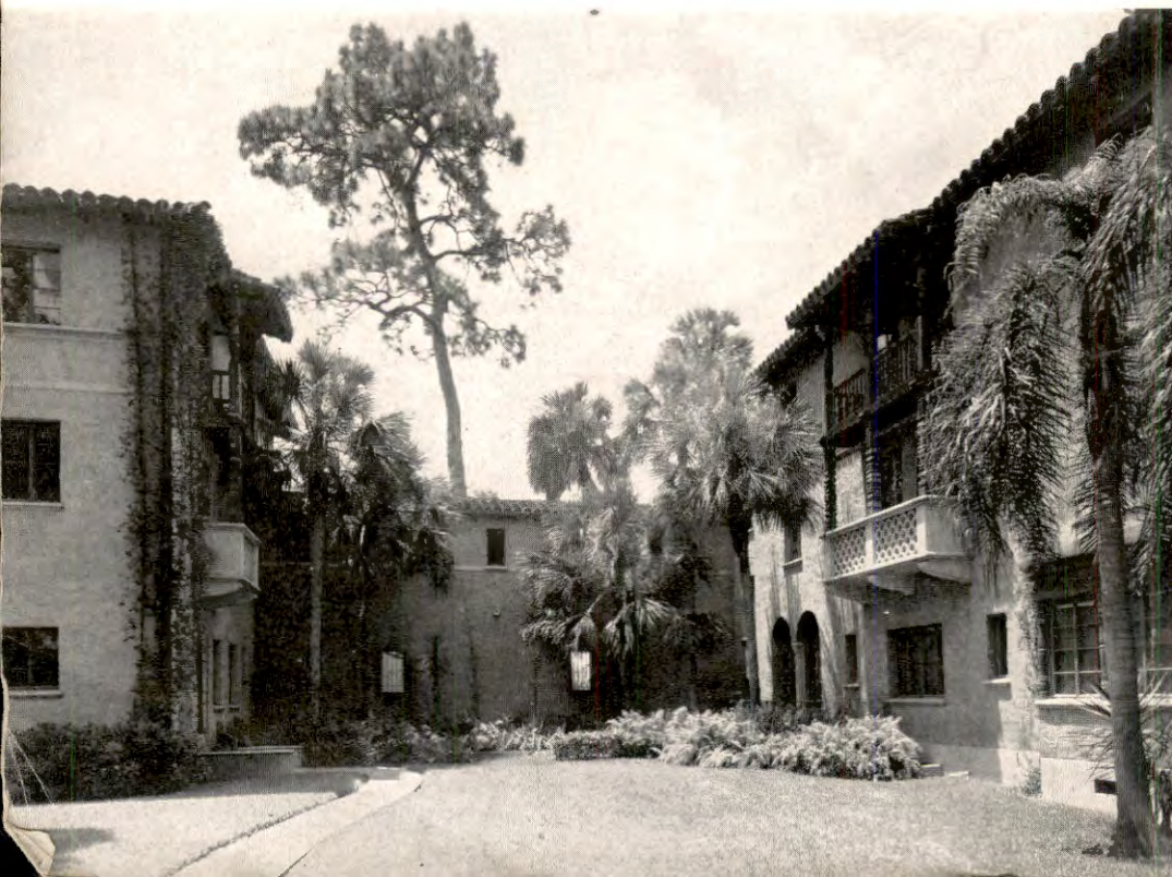
PATIOS SEPARATE THE WOMEN'S DORMITORIES