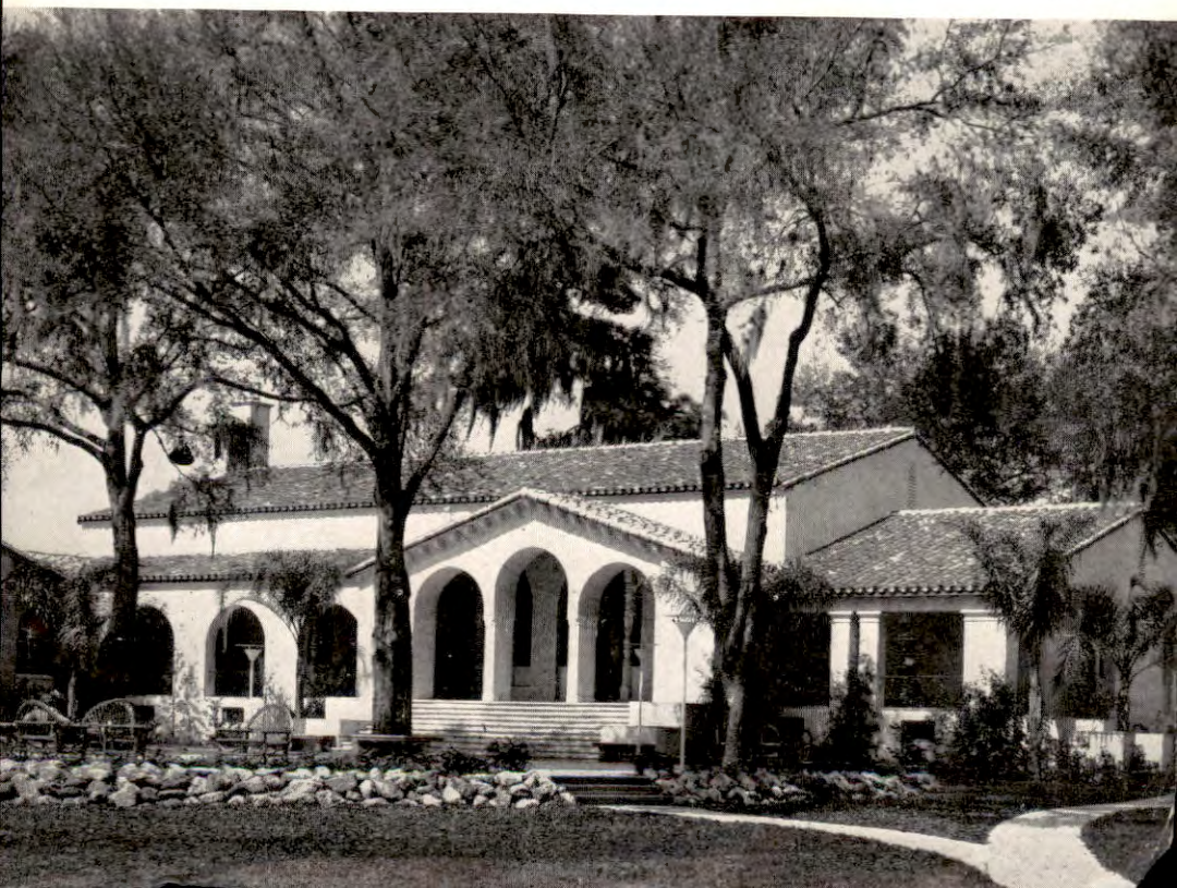
THE ROLLINS CENTER IS THE HUB OF STUDENT ACTIVITIES