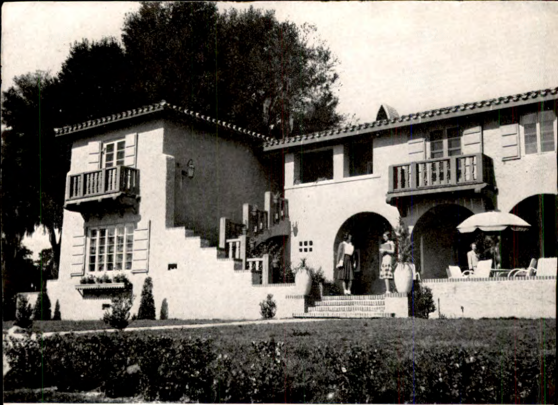
LA MAISON PROVENCALE IS USED FOR LANGUAGE CLASSES