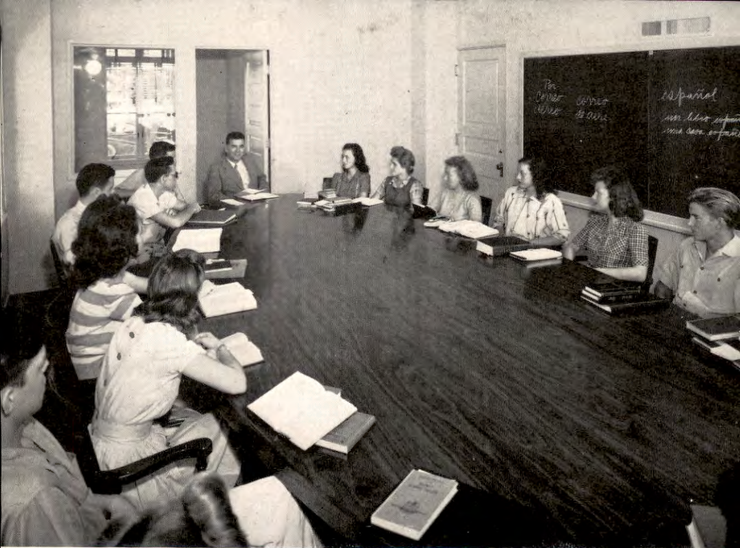
THE ROUND TABLE METHOD OF DISCUSSION EXEMPLIFIES THE CONFERENCE PLAN