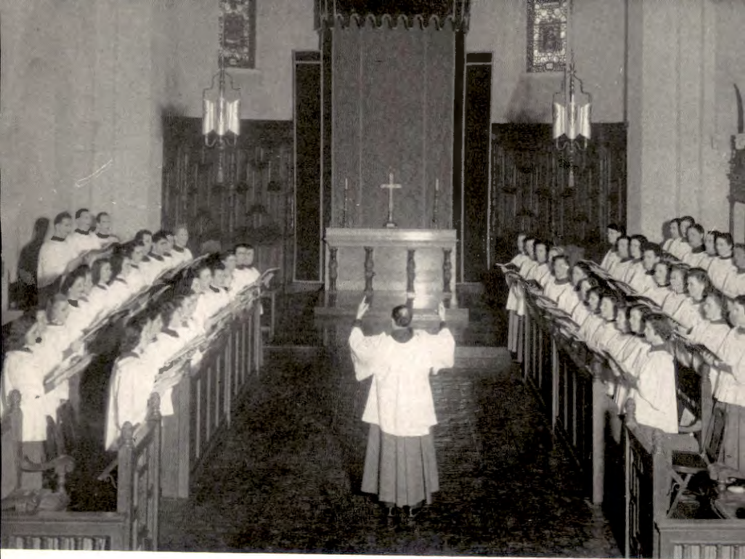
THE CHAPEL CHOIR IS OPEN TO ALL STUDENTS