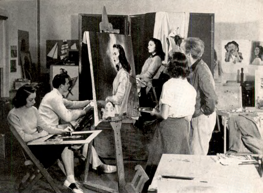
THE CREATIVE IMPULSE FINDS EXPRESSION IN ART