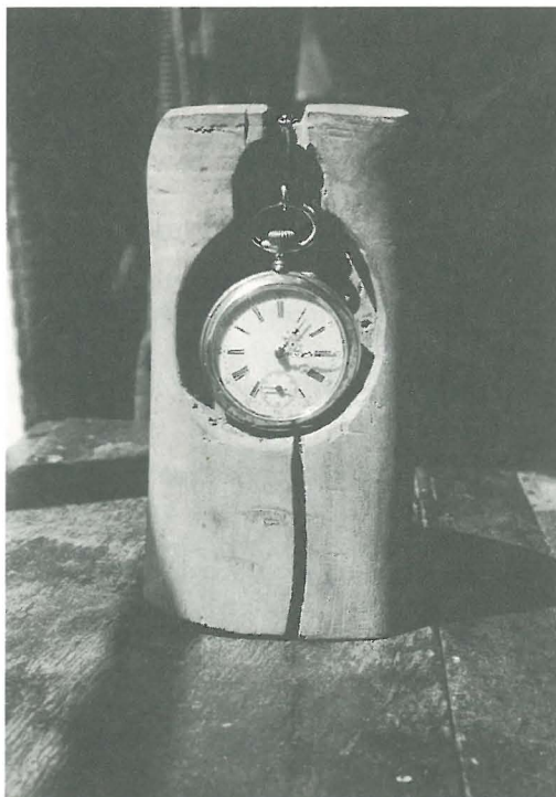
Woodblock purportedly used by Whitman to hang his watch