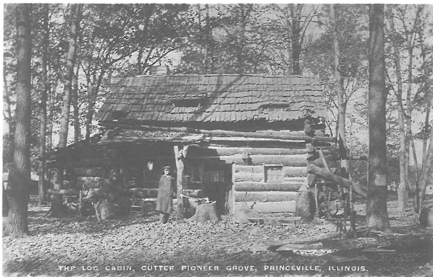
THE LOG CABIN, CUTTER PIONEER GROVE, PRINCEVILLE, ILLINOIS.