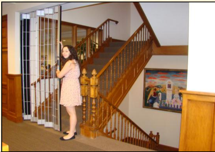
Pocket doors will be closed nightly to maintain the security of the other floors in the library while still allowing complete freedom of movement on the main floor. Students will use their R-cards to gain access to the building after hours, where they will be able to take advantage of the computing labs and study spaces at any time, day or night.