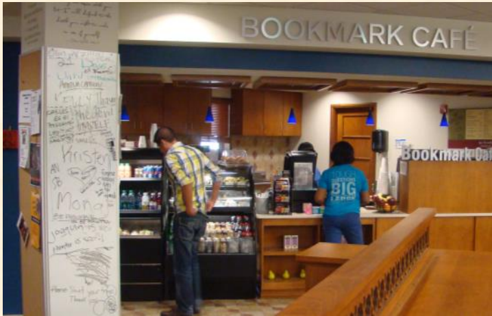
The Free Speech Column in front of the Bookmark Café